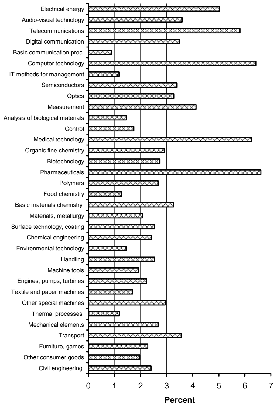
Figure 2: Distribution of international applications of the priority year 2005 to technology fields 6 according to the definitions of table 2, relative values